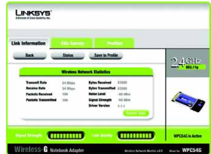
Figure 6-3: Wireless Network Statistics

Click the Back button to return to the initial Link Information screen. Click the Status button to go to the Network Status screen. Click the Save to Profile button to save the currently active connection to a profile. Click the Refresh Stats button to refresh the screen.